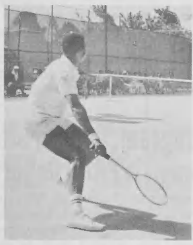
Tennis at Aruba Caribbean Hotel